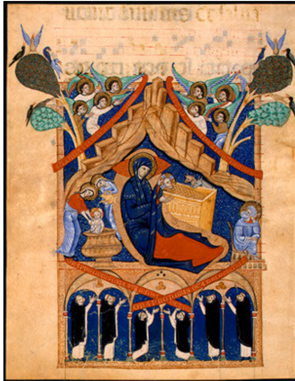
The Nativity with Six Dominican Friars , Italian, c. 1275 Rosenwald Collection, U.S. National Gallery of Art

from the Roman Martyrology adapted for the Order of Preachers